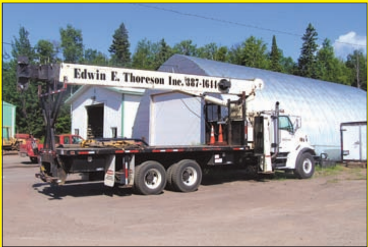
Our new truck crane