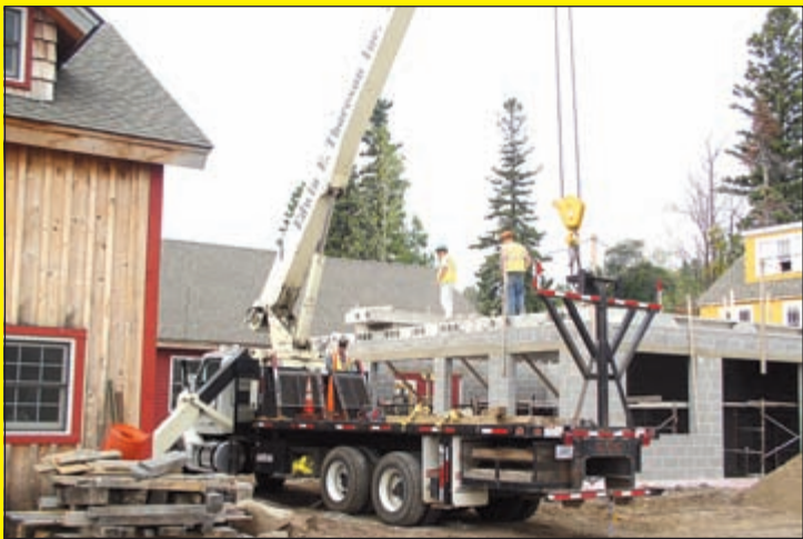
Erecting new building at North House Folk School 2008