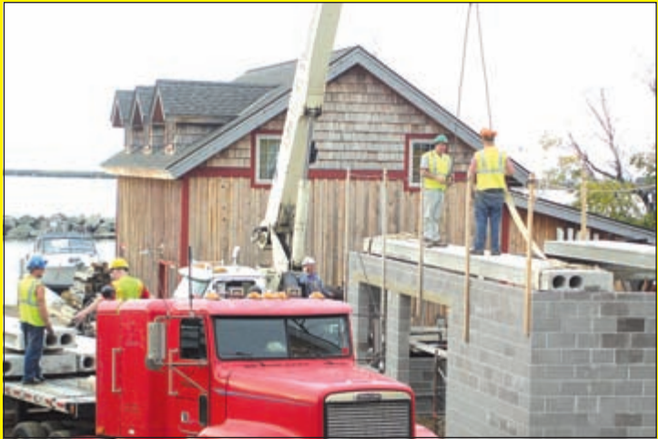
Erecting new building at North House Folk School 2008