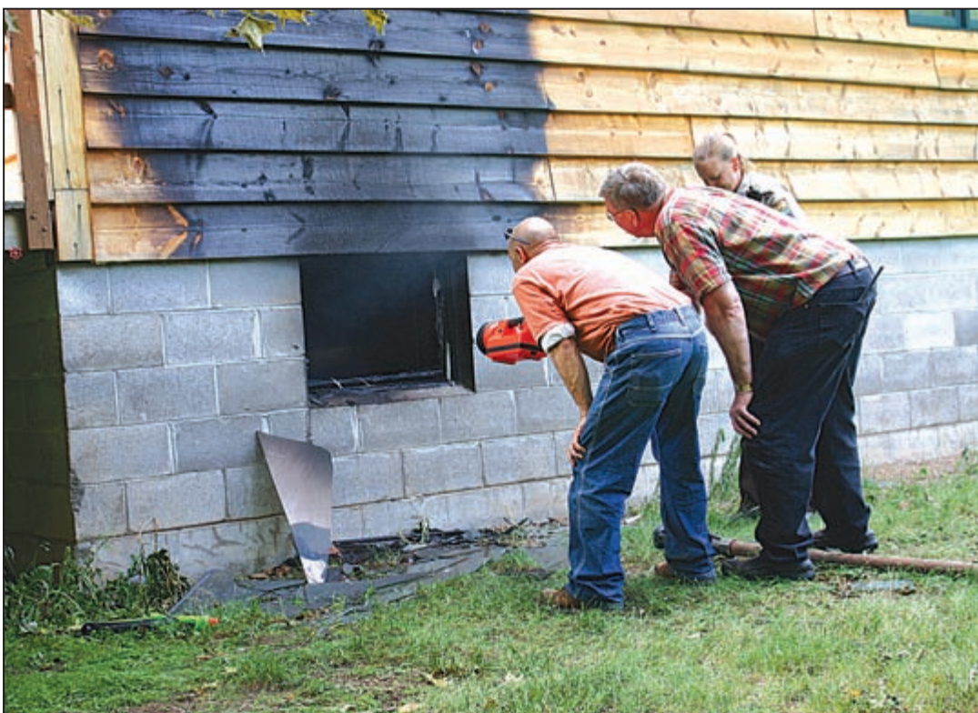
responded and the fire was quickly extinguished and the smoke ventilated. The fire