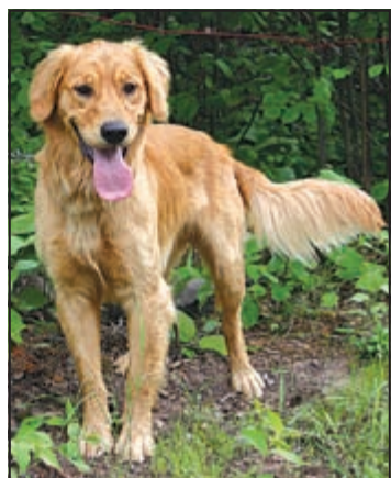
Staff photos/Rhonda Silence