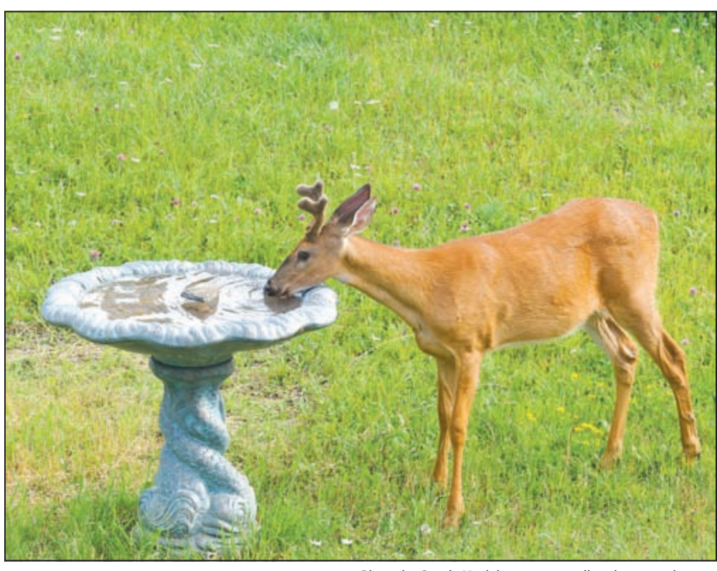
This beautiful young buck paused for a drink at the bird bath in the Hovland yard of Sandy and Bruce Updyke. Sandy noted that it is a rare treat to see a buck in velvet in one's yard.