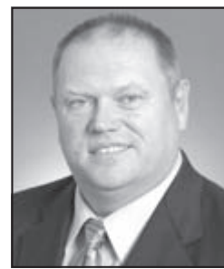
Senator Tom Bakk

State Sen. Tom Bakk, DFL-Cook, was presented with two 2009 Coalition of Greater Minnesota Cities' (CGMC) Legislator of Distinction Awards on Land Use and Tax Policy on July 31.