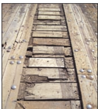
The 50-year-old bridge at the end of the Arrowhead Trail may have reached the end of its lifespan. Left: The bridge's vertical timber pilings are starting to rot. Above: Car tires could be damaged or possibly drop through the bridge planks.